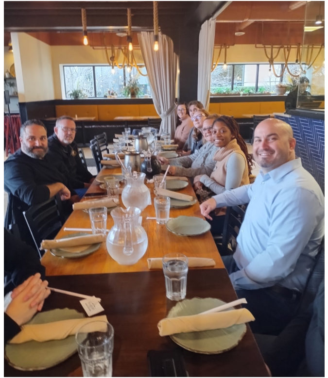
Coming together to share ideas and feedback—here's to continued collaboration and success! These pictures showcase moments from our second winter luncheon.