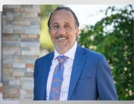
Role play session as a buyer's agent post NAR settlement